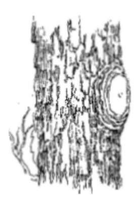
Image below is an improperly executed cut, made flush to the trunk, damaging the branch collar.

Image below is a properly executed pruning cut made close to the trunk but not disturbing the branch collar.