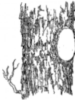
Image below is an improperly executed cut, made too far out on the branch, leaving a branch stub.

Image below is an improperly executed cut, made flush to the trunk, damaging the branch collar.