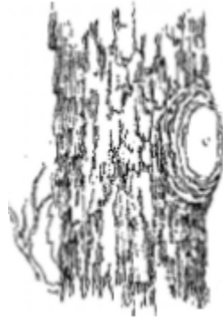
Image below is an improperly executed cut, made flush to the trunk, damaging the branch collar.

Image below is a properly executed pruning cut made close to the trunk but not disturbing the branch collar.