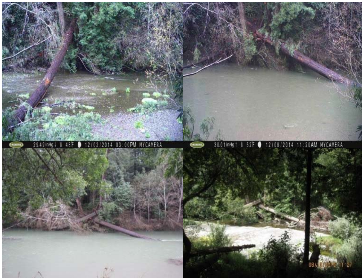
Figure 4. LWM recruitment project in the Gualala River watershed.

Inc. (GRI) 8 successfully retained LWM within the South Fork Gualala River (Figure 4). In this project, GRI directionally felled a large redwood tree between two standing trees. The fallen redwood tree remained despite being shorter than 1.5 times bankfull width and having weathered through several storm discharge events up to 28,500 cubic feet per second (cfs). However, there were two other trees further downstream which were directionally felled as part of this project that were mobilized during moderate-size storm events. Using the AWR method in larger stream channels or rivers should be carefully planned and implemented depending on the identified goals and objectives of the (v)(2) project. Unanchored wood projects in the Gualala River watershed have shown that (1) concentration of wood pieces appears to be more important for pool formation than individual pieces dispersed throughout a reach, and (2) the size of wood relative to channel cross-sectional area appears to be key for effective creation of wood-formed pools (Church 2012).