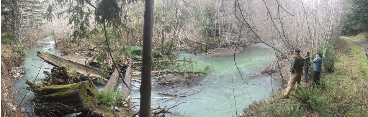
Figure 5. Trout Unlimited staff reviewing an accelerated recruitment project in South Fork Ten Mile River.

In some circumstances, landowners may also be eligible for tax-based incentives for conducting large wood restoration projects. Landowners who are working with a 501(c)(3) non-profit environmental organization have the option of making a charitable donation in the form of woody materials (trees).