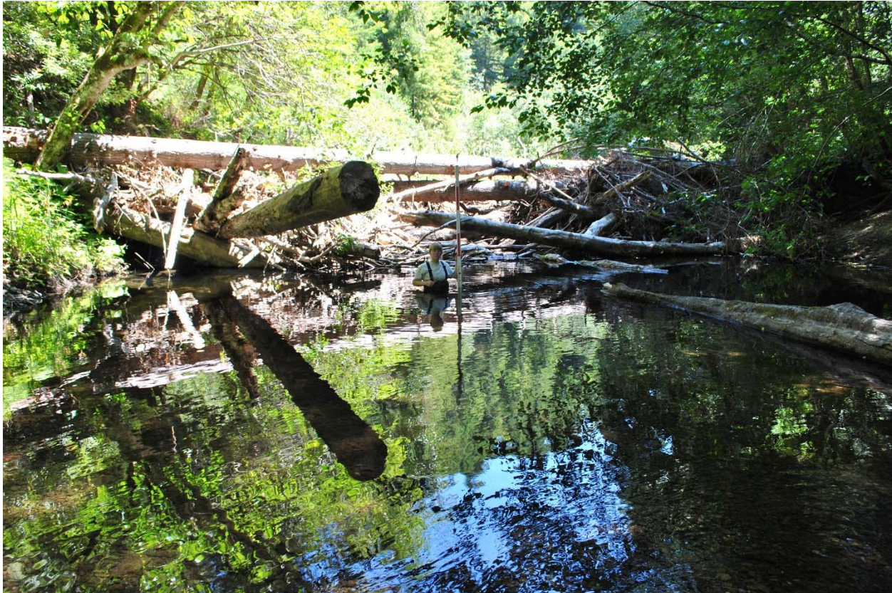
Figure 2. Pool formed by large wood restoration on the Ten Mile River.

initiated streambank erosion recruiting whole trees. Existing pools in the Ten Mile River became deeper and new pools were formed. Complex cover and shelter within pools increased significantly. Fisheries biologists who monitor smolt production from the Ten Mile River have seen production progressively increase (up to six times) since the treatment (D. Wright, TNC, unpublished data). Although there are many factors contributing synergistically that may explain the increased smolt production, there is general agreement among biologists that the AWR treatment is likely a major contributor to this increase.