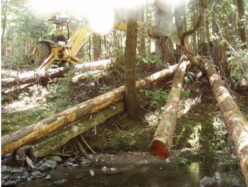
Figure 3. Ken Smith weaving large wood into a fish-bearing watercourse.

streams or logs placed in streams dislodging and floating downstream must be considered when proposing unanchored wood projects as part of Plans. In some cases, large wood structures may need to be engineered to keep the structure in place during high flows and not adversely impact downstream infrastructure.