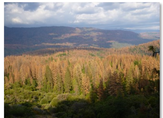
Figure 4. Recent drought impact on forests in the Sierra National Forest, southern Sierra Nevada.

This process involves a careful look at your forest and the land it grows on, sometimes referred to as a forest condition assessment . In forests, a “stand” is a common way to describe a group of trees that are similar in terms of species composition, age classes, and growing conditions. A stand is typically between a few to more than 100 acres in size. We will use this term frequently because a stand is generally the unit for which management is designed or executed.