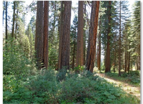
Figure 1. Healthy multi-structured forest with large dominant trees.

Managing forested lands can be a difficult task for small parcel landowners in California due to a variety of technical, legal, and operational challenges. However, forest lands in the Sierra and Cascades need management attention due to the significant changes in forest conditions over the last 100 years. Many areas, particularly those that have not experienced fire for many decades, have tree densities that are three to ten times higher than 100 years ago, and are dominated by smaller trees that are more vulnerable to fire (Figs 1 and 2). Trees are dying at accelerated rates in response to drought and competition for water, forest fires are becoming larger and more intense, and changing climates forecast worsening conditions in the coming years and decades. Investing in the health of your forest today can help achieve short and long-term goals and objectives for your property.