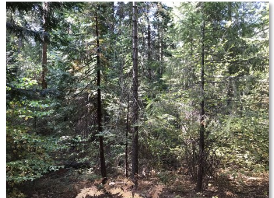
Figure 2. Dense forest stands common throughout the Sierra Nevada.

The Forest Management Handbook for Small Parcel Landowners in the Sierra Nevada and Southern Cascades and its attending worksheets will help landowners build a “California Cooperative Forest Management Plan”. This management plan template meets the requirements for grants and other provisions available to small parcel landowners via agencies like the California Department of Forestry and Fire Protection (CAL FIRE), USDA Natural Resources Conservation Service (NRCS), United States Forest Service (USFS), and the American Tree Farm Association. The plan will help determine what management action(s) are appropriate for your land, how to obtain technical and financial support, and what, if any, permits may be necessary. Developing and executing an effective forest management plan may seem like a large and complex task; however, while it may certainly require some effort, it is attainable.