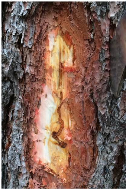
Figure 6. Pine beetle galleries. A common sign of mountain pine beetle attack is the presence of fine sawdust in the bark crevices along the trunk of the tree, an indicator of the beetle larvae feeding on the nutrient-rich tissue (phloem) of the tree.

Fire is both a necessary component of and a potential major threat to a forest in the Sierra and Cascades. Periodic and low to moderate intensity fire was common in conifer forests of this region until about 100 years ago. Historically, such fire was the primary mechanism by which the forest thins itself and reduces fuels, opens the forest and makes it more resistant to further disturbances. In part due to the absence of periodic low intensity fire for many decades, many forest stands have become dense with abundant fuels (branches and needles on the ground and in the low hanging canopies of small trees). As a result, high severity fire has become the biggest present-day threat to forests in the region (Fig 5).