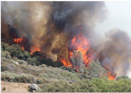
Figure 5. 2021 Caldor Fire in the Sierra Nevada.

Depending on current conditions of your forest, it may be more or less vulnerable to an array of potential threats. While it's normal for forests to experience a variety of stressors (which impose physiological strain or stress on the forest via events like drought or heatwaves) and disturbances (which force direct change in plant composition and structure through specific events like fire, mudslides or insect outbreaks), it's important to recognize when they become threats to the objectives you have for your forest property.