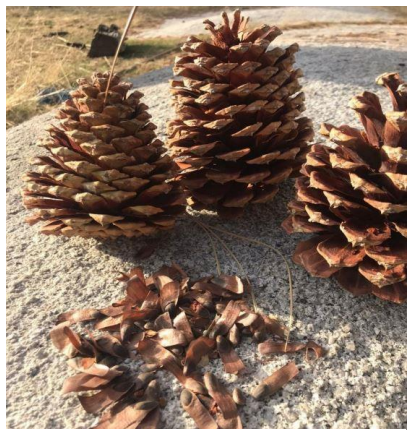
Jefferey pinecones and seed from Baja California.

the California Department of Parks and Recreation (State Parks) for cone survey, collection, and seed storage was drafted and discussed between the two agencies. Final approval is expected in early 2024.