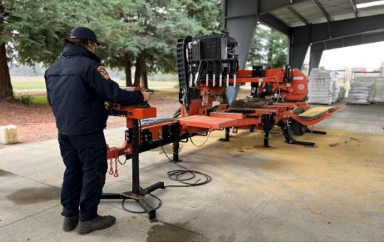
Forestry Aide, Ricky Tapia, operating the Wood-Mizer portable sawmill.