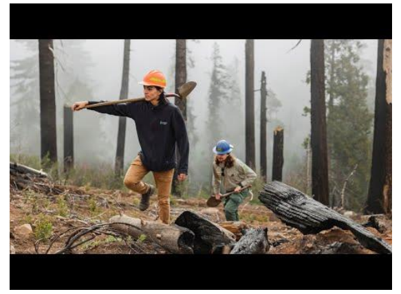
A video produced by American Forests about reforesting California after wildfire.

Continued support of the statewide <u>Reforestation Pipeline Partnership (RPP)</u>, led by American Forests, with additional support from the US Forest Service. The RPP is a cooperative of various industry professionals regularly communicating and sharing ideas and resources. This initiative also established the Cone Corps Program , comprised of entry-level workers engaged in various operational processes relative to reforestation, namely cone surveying and monitoring. In 2023, 16 new cone corp members were brought on and four RPP meetings were held with a total of over 200 attendees.