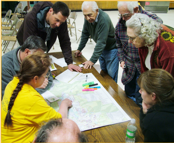
Community members in Humboldt County review county maps.

unique to the local areas. If a local community prefers, Humboldt County staff are available to collaborate with local fire safe councils, tribes, and other local organizations to create local CWPPs and/or Firewise assessments and action plans and facilitate the process of getting local CWPPs certified by the Board of Supervisors.