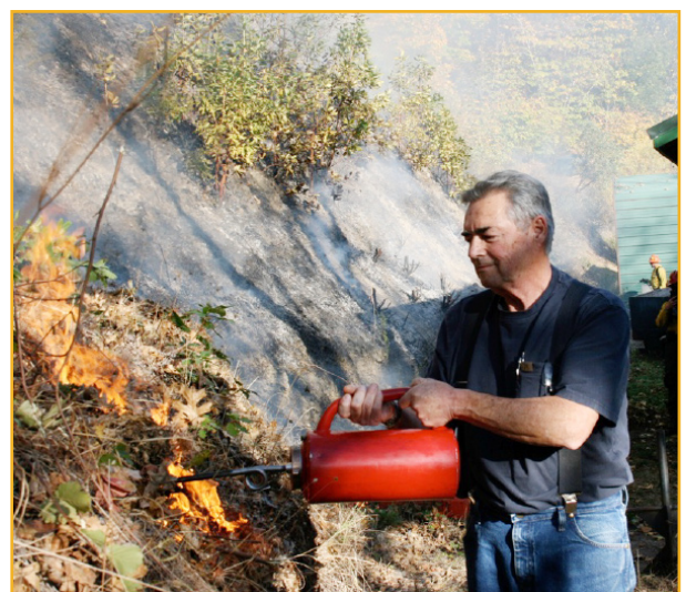
A Yurok elder protecting his home from Wildfire.