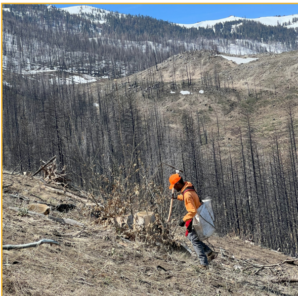
Alpha Services performing tree planting for the Lassen Fire Safe Council in the Sheep Fire footprint.

Regular CWPP project meetings and updates are often used to maintain momentum and enthusiasm around projects. As one example, Lassen County's CWPP working group has met regularly since 2015 to review and rank wildfire mitigation projects across the county. The group meets quarterly via video call to share new and ongoing project information, and each project is documented in a single spreadsheet. Every November, the group meets in person to hear about project details directly from the project sponsors and then collectively rank all projects. The result is an annual CWPP work plan that ensures the CWPP is current and effective. The Lassen County Fire Safe Council also holds monthly meetings that are open to the public to keep community members informed about the CWPP work plan and project activities.