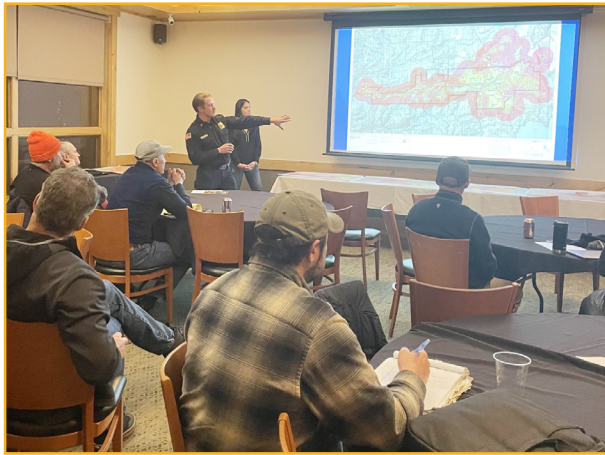
Truckee Fire Protection District uses GIS technology to convey fire risk information to community participants.

Technology is also used to inform the public about CWPP projects. Napa County has an online CWPP Hub where residents can read the county CWPP and view a series of thematic maps that have various layers (e.g., topography, watersheds, CWPP boundary, public ownership). The Hub also contains the Napa County Firewise Foundation (NCFF) Fuel Reduction Project Dashboard which is a project database that shows all CWPP projects by type, location, funding source, and status. The dashboard includes NCFF-sponsored projects as well as those originating from other agencies and organizations performing fire mitigation work. The result is a comprehensive look at all fire mitigation activities occurring across the county. Sonoma County's CWPP Hub Site also houses the county CWPP and maps, and it provides a Project Planning Tool to help plan fire mitigation projects. The end user simply uses the tool to outline their project on a map to view relevant statistics that can be used in project planning, such as the wildfire hazard index, population, and number of structures. The Sonoma County CWPP Hub Site also has a Project Entry Portal where end users can