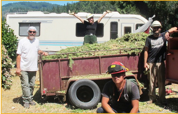
Humboldt County chipper day.

specific topics. During the last update of the CWPP, the working groups were organized around and focused on the development of each of six goal areas in the CWPP Action Plan. The focus has since shifted to implementation, and working groups are now formed on an ad hoc basis. These ad hoc working groups also invite participation from other special interest stakeholders, such as local project coordinators, who do not have an appointed seat on the HCFSC. The County Coordination Team is currently funded by a grant from the California Fire Safe Council and plays an important role in convening the working groups, tracking their outputs, and serving as a liaison to the larger HCFSC.