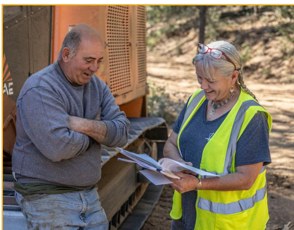
A Mariposa Fire Safe Council member reviews NEPA documents with a contractor.

Other CWPP working groups are created through other mechanisms. The Humboldt County Fire Safe Council (HCFSC) is a Board of Supervisors appointed committee facilitated by the County Coordination Team. The HCFSC consists of twenty-one member seats (primary and alternate) representing the full spectrum of organizations engaged in wildfire planning and response within the county, including federal, state, and local groups. Members and their alternates participate in independent working groups focused on