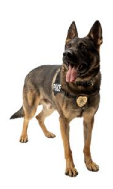
<u>Flash</u> Explosives / Firearms Canine